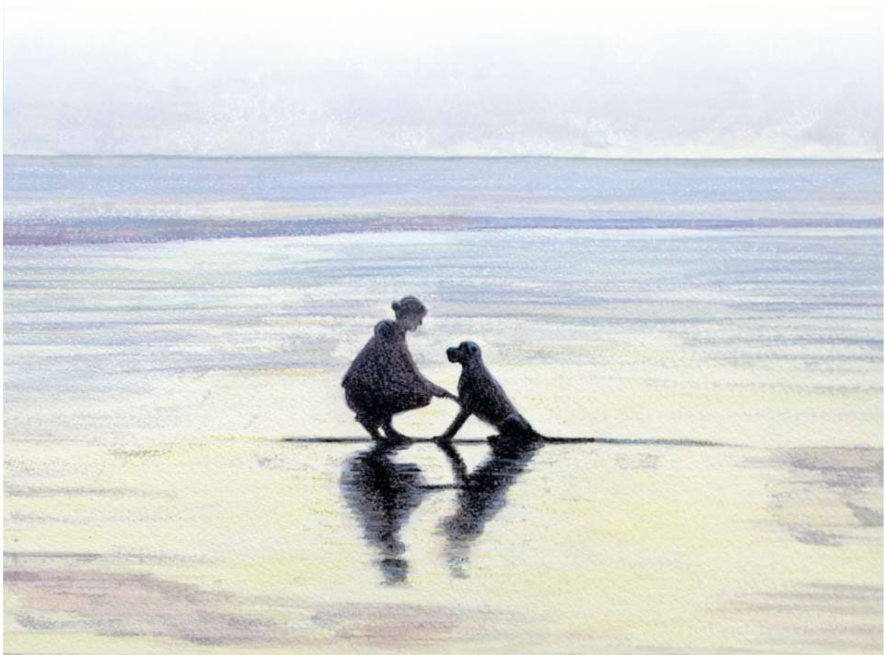
Illustration © Sarah Flint