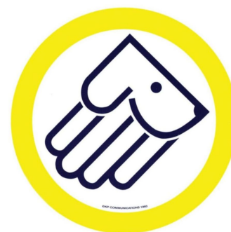
Assistance Dogs (UK)

Sessions are held remotely via Teams and are open to all staff and volunteers from ADUK member organisations.